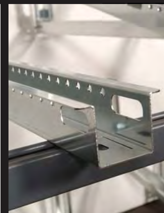
Formed Bike Tray Holds Any Style Bike