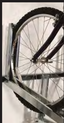
Tear-Drop Tire Slot